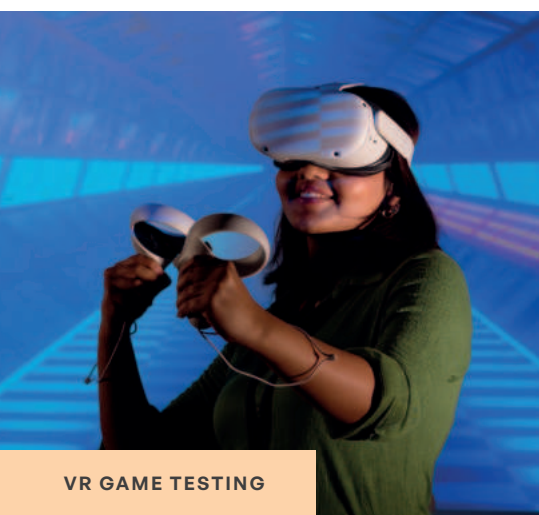
VR GAME TESTING