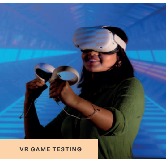
VR GAME TESTING