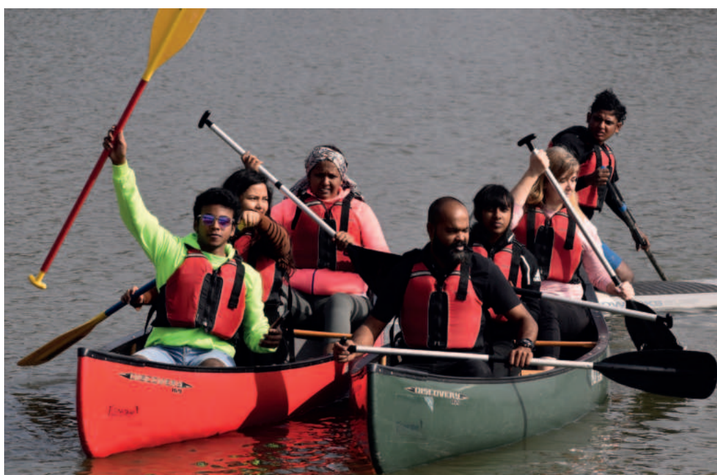
CMRU CANOEING CLUB