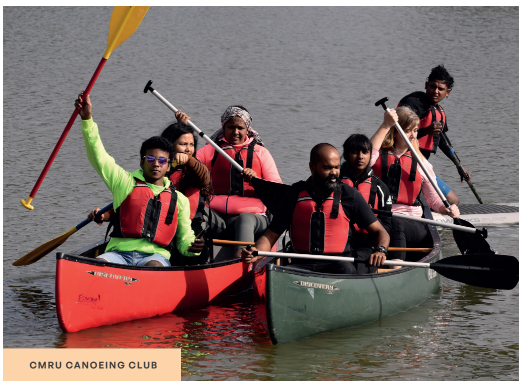
CMRU CANOEING CLUB